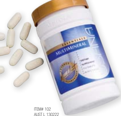
ITEM# 102 AUST L 130222