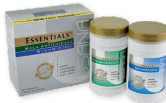
ITEM# 101 AUST L 133145

For your convenience, order both of the Essentials™ – Mega Antioxidant and MultiMineral – in a single package.